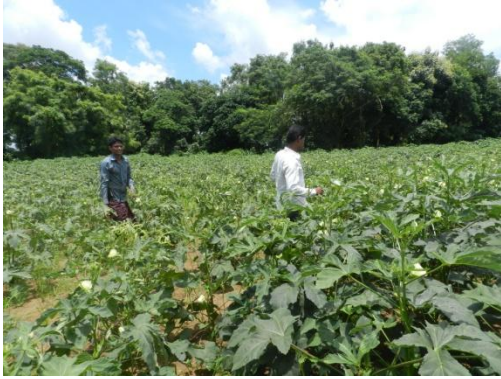
Farmer in Okra Field