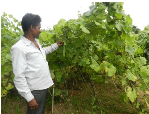
Farmer in Ridge gourd Field